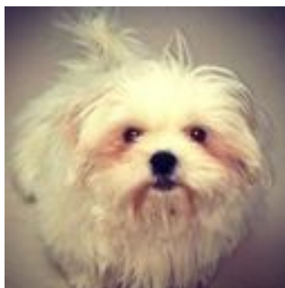
Cooper Chilton, now 5 months old. One of Jasmine's puppies.