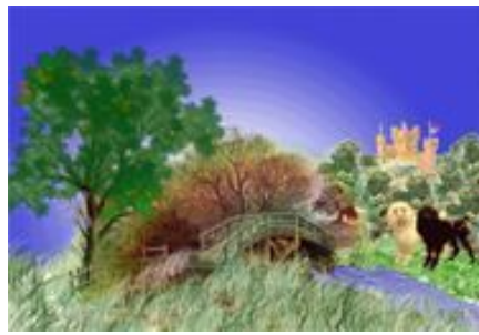
Dedicated to those who have passed over.