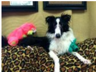
"Casey" Dreamweaver Farms--Pacolet, SC