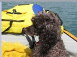
Coco at Lake Lake Jocasee