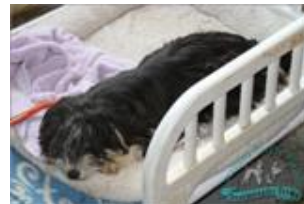
I'm Rose and am heartworm positive