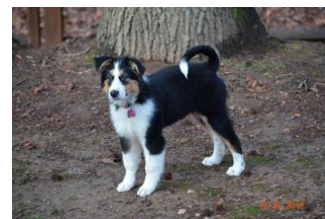
Koda Lemmon enjoying an outing.