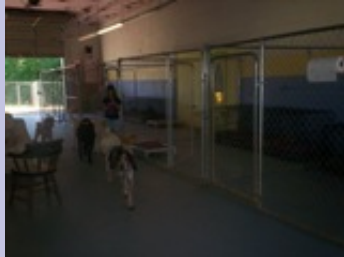
standard poodle side