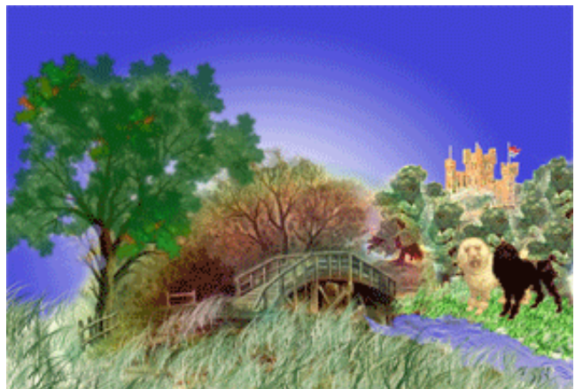
The Rainbow Bridge

There are more pictures on our website if you wish to see more! Click here to view the webpage.